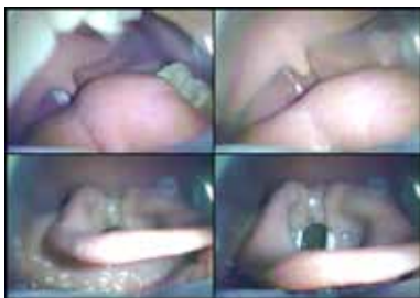
Realistic airway for intubation with flexible jaw and tracheal landmarks

All TraumaFX Products are handcrafted in the USA