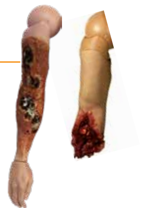
Optional burn and non-bleeding amputation arms