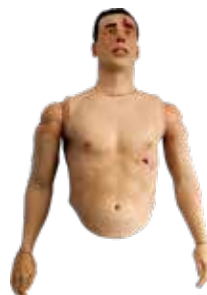
Active Shooter Upper